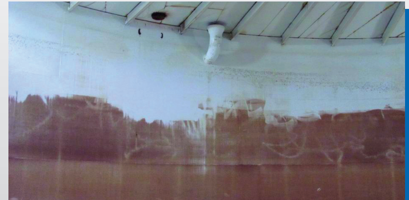
Interior washout of welded steel tank

By performing minor coating repairs during tank cleaning, the coating system life can be extended & metal loss due to corrosion can be prevented.