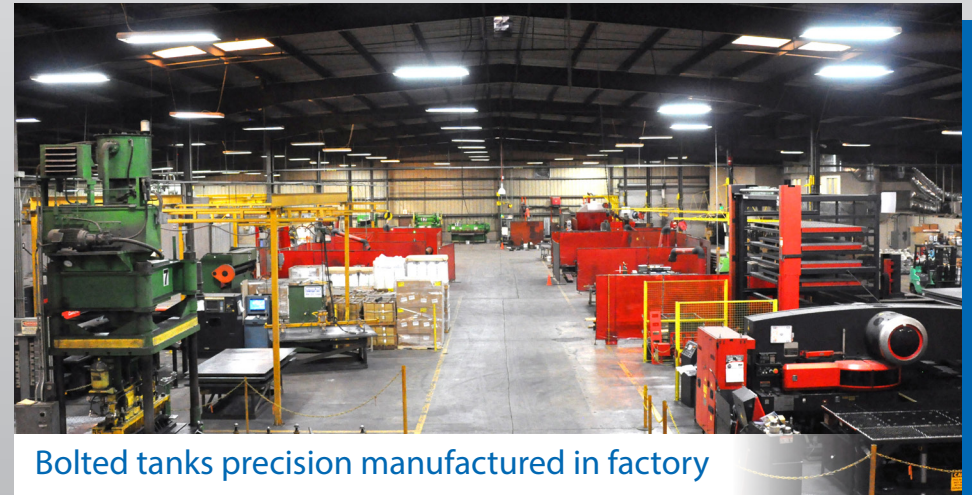
Bolted tanks precision manufactured in factory