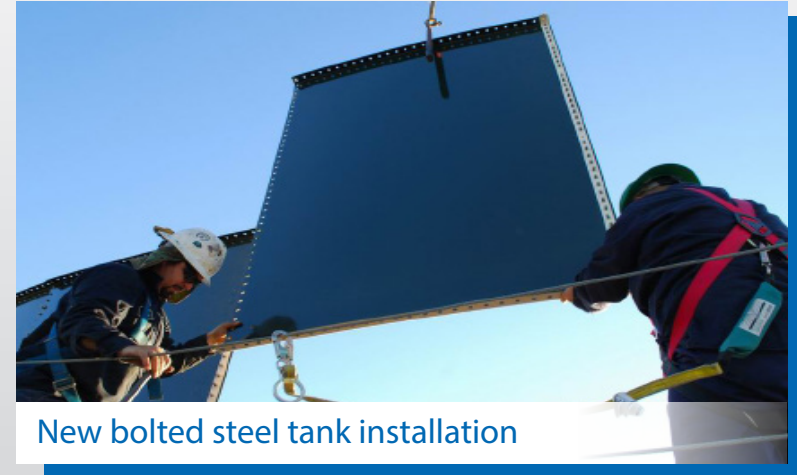
New bolted steel tank installation

STS holds General Contractor licenses in California (#939335) and Arizona (#269751) and utilizes internal installation teams. Our field teams specialize in bolted and welded steel tanks, making installation hassle free and fast. Safety is paramount with our installation crews and we take the steps necessary to maintain worker safety.