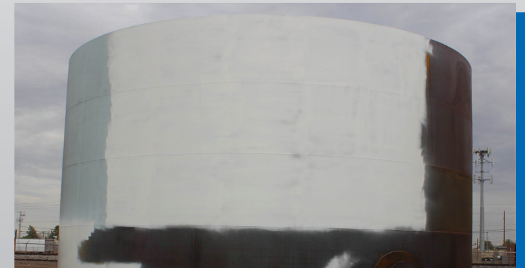
Coating rehab in progress