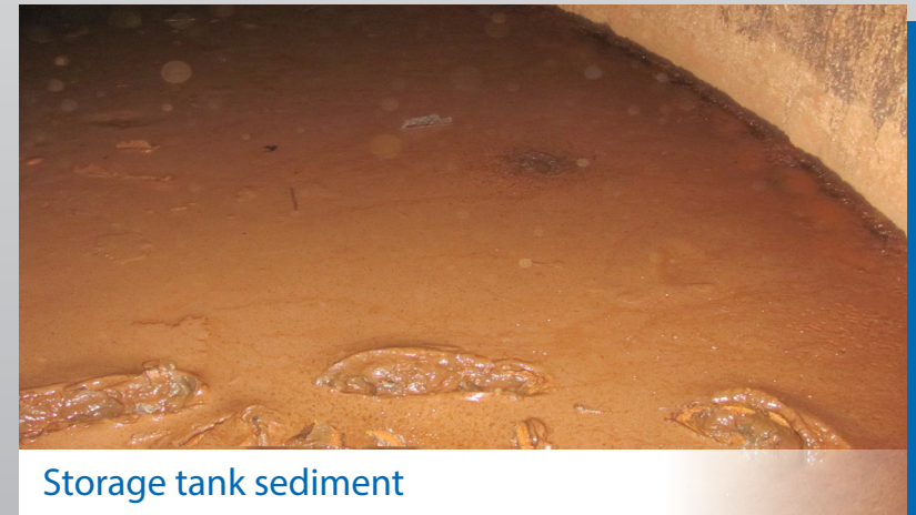
Storage tank sediment

Ask amount our new Automated Disinfection Systems!