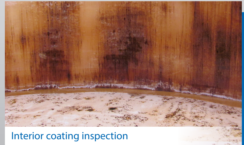
Interior coating inspection