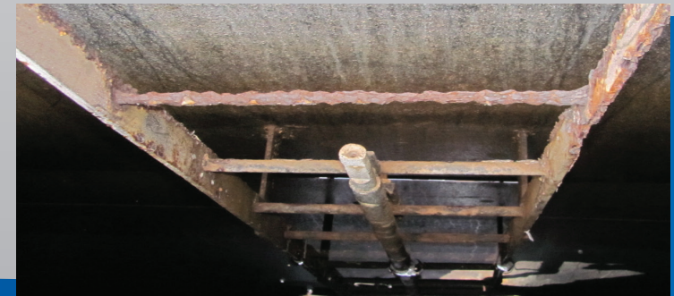
Rusted ladder in need of replacement

For more information on parts and accessories, please visit: