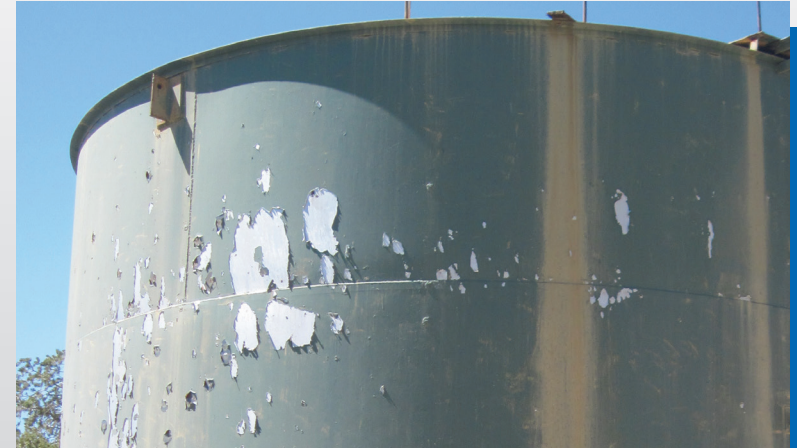
Exterior coating assessment

Routine tank inspections can discover potential problems early and eliminate expensive repairs in the future.