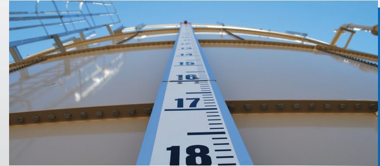
New and replacement parts available!